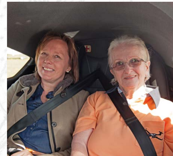
2 persons in the third row (about 1.70 m / 5 ft 7 in)