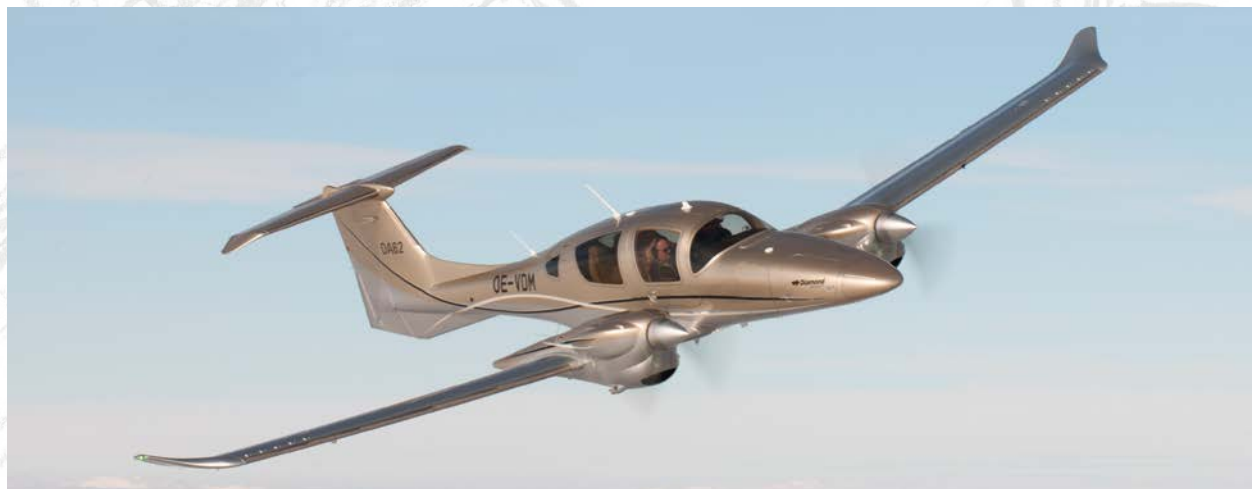
Gold metallic & light silver