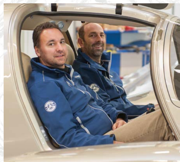
Person in front with 2.00 m / 6 ft 7 in height Person behind with 1.93 m / 6 ft 4 in height