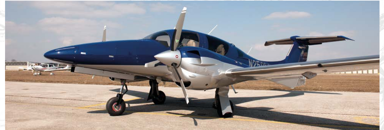
Example for a customized color