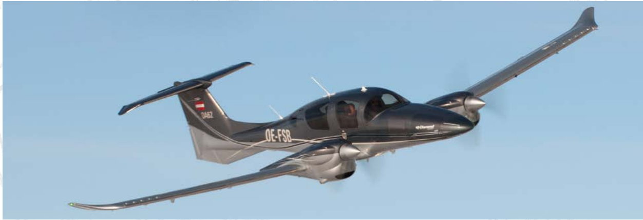
Carbon metallic & light silver