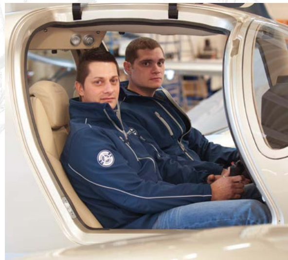
Person in front with 1.75 m / 5ft 9 in height Person behind with 1.85 m / 6ft 1 in height