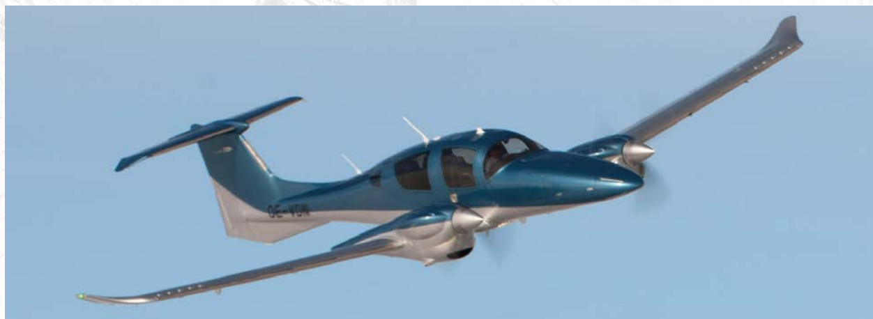
Sapphire metallic blue & light silver