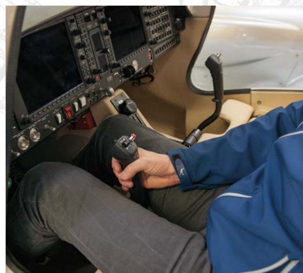
Legroom for a person with 1.93 m / 6 ft 4 in height