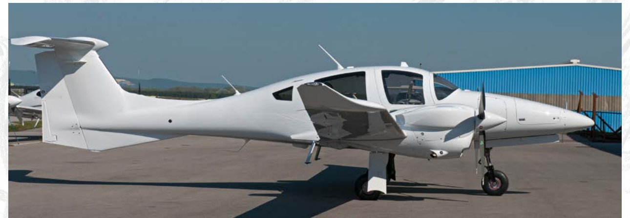
Glossy white (standard color)