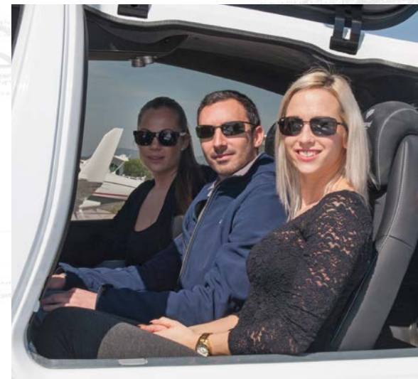
3 persons in the second row (about 1.75 m / 5 ft 9 in)